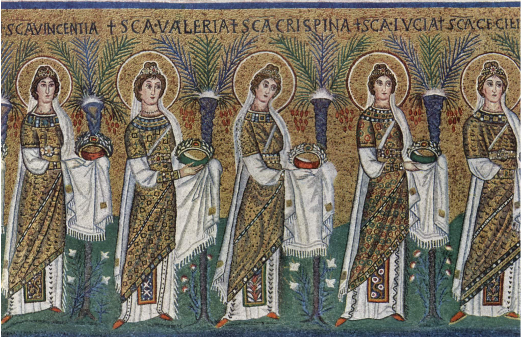
Procession of the Martyrs Mosaic, Basilica of Sant' Apollinare Nuovo, Ravenna, Italy. 6th century

Sunday, November 13, 2022 The Twenty-Third Sunday After Pentecost